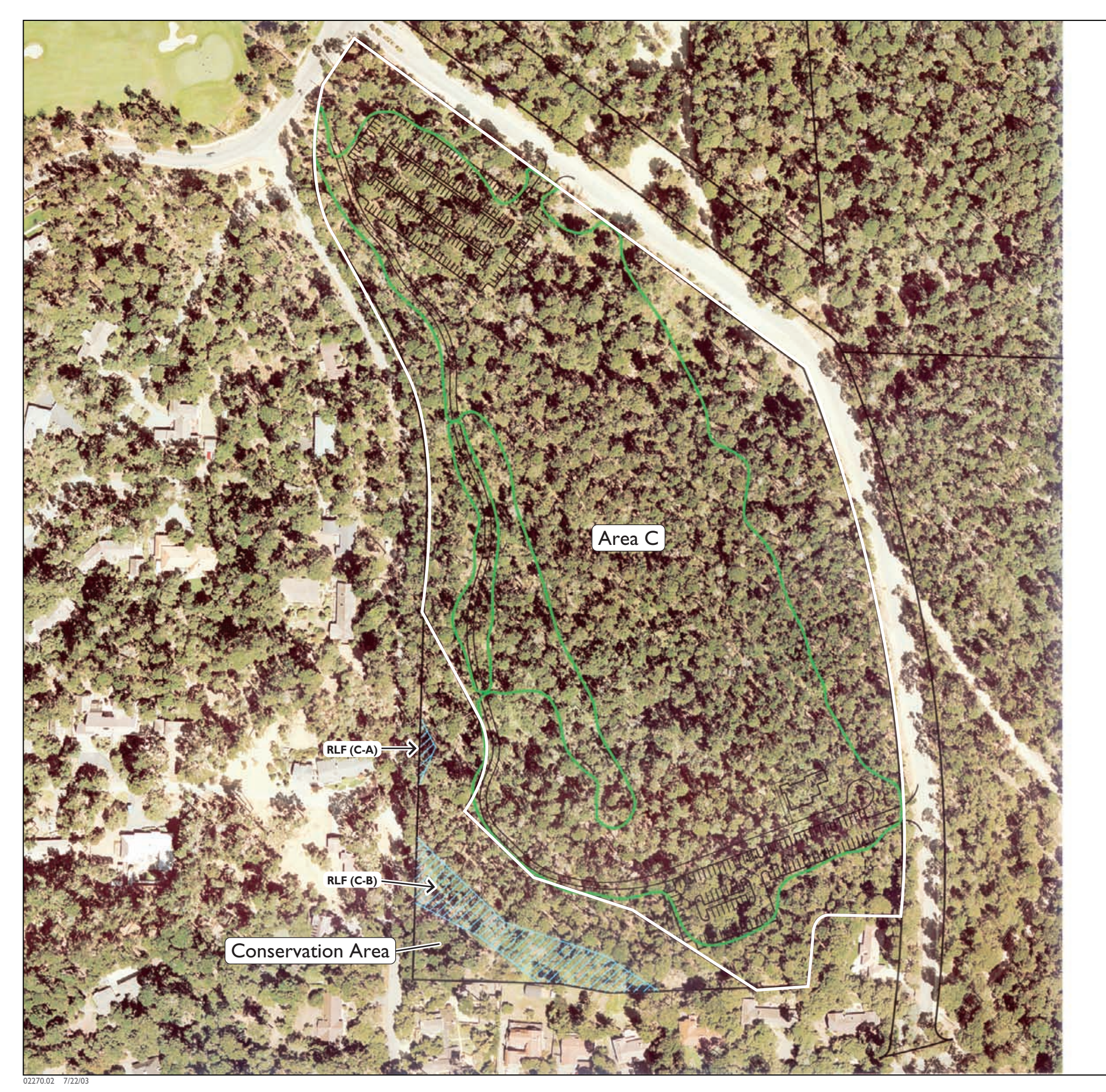
Figure E-II Spanish Bay Driving Range (Area C) - Biological Resources and Disturbance Areas