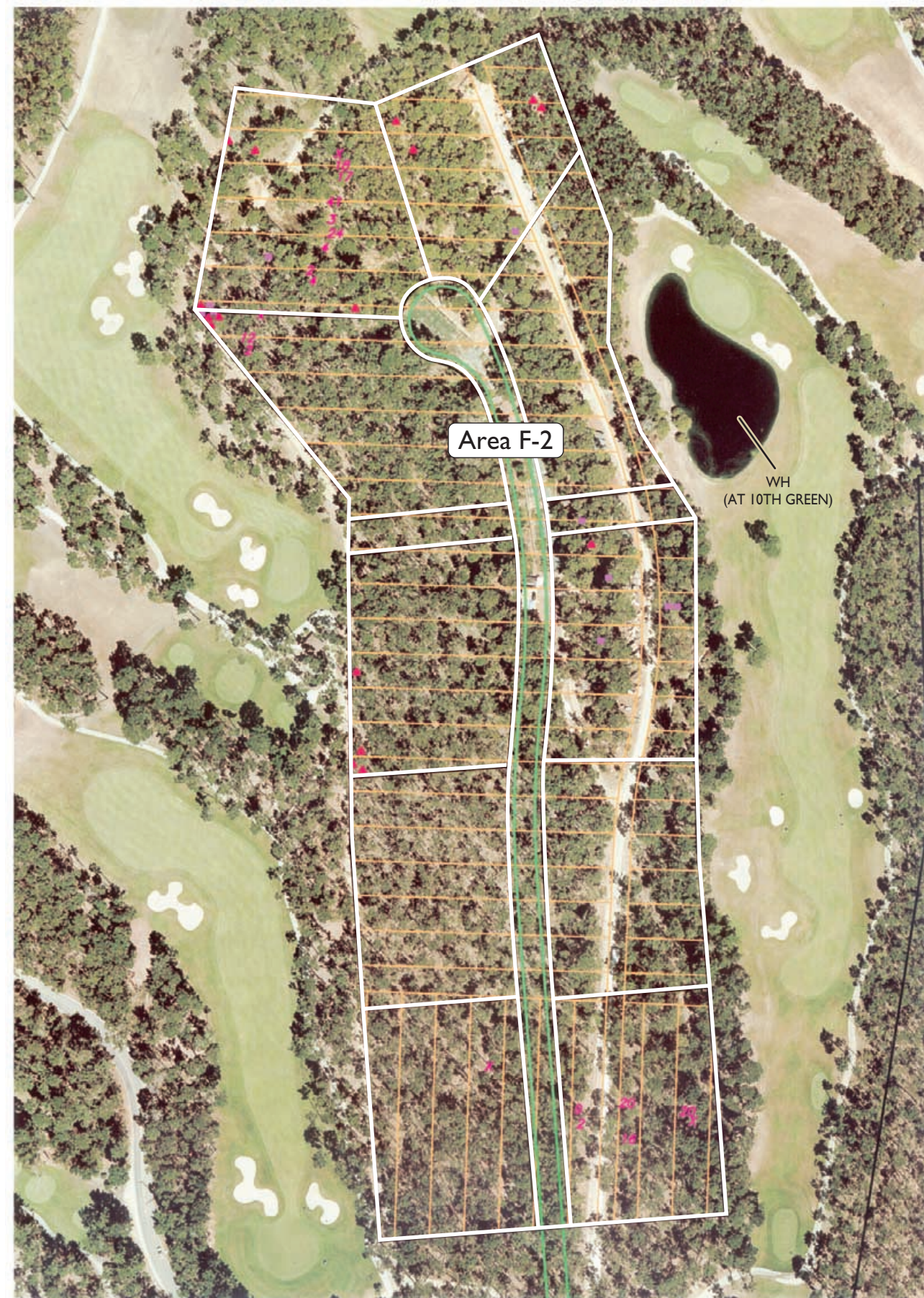
Figure E-13 Residential Area F-2 – Biological Resources and Disturbance Areas