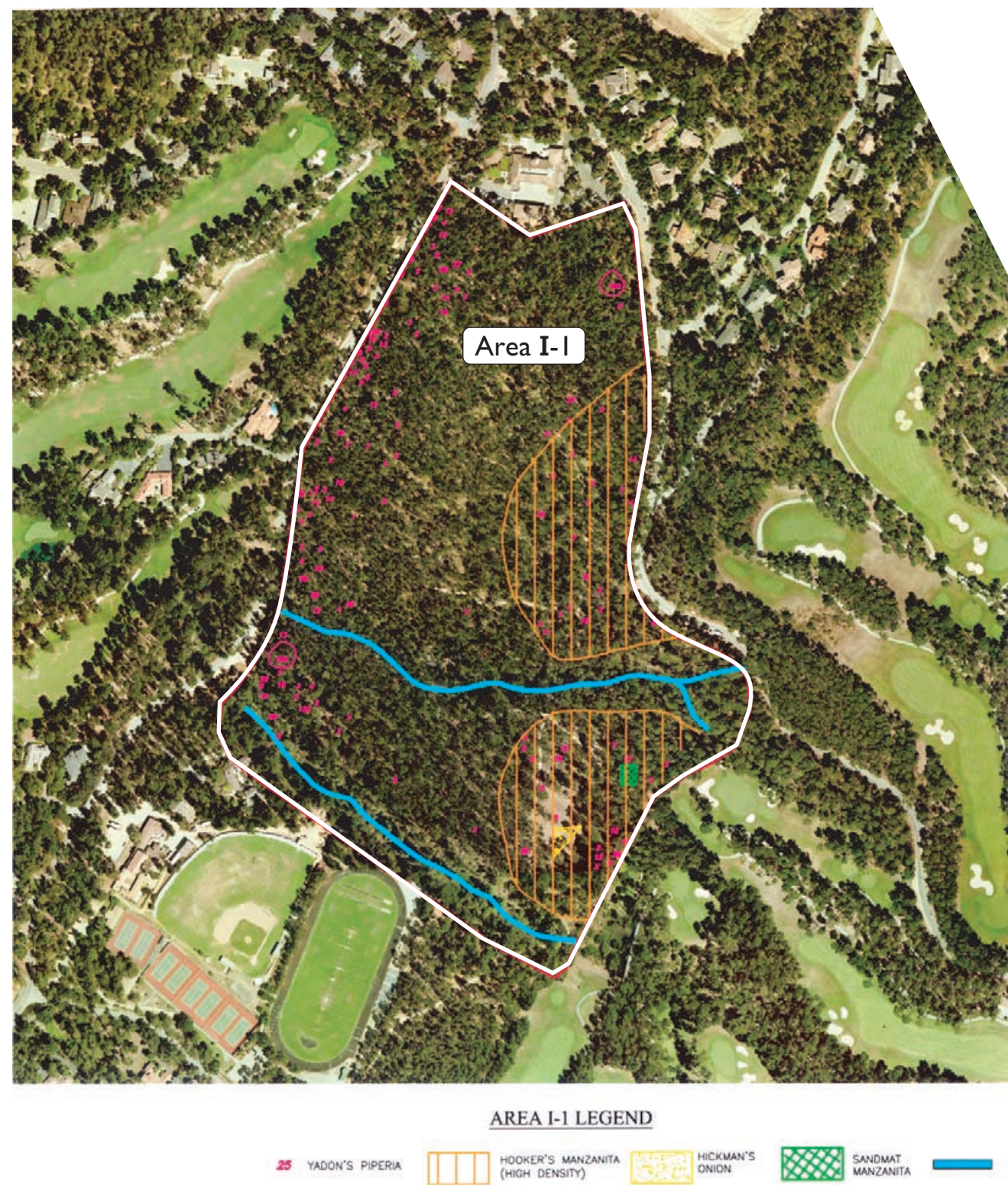
Figure E-19 Preservation Area I-1 – Biological Resources