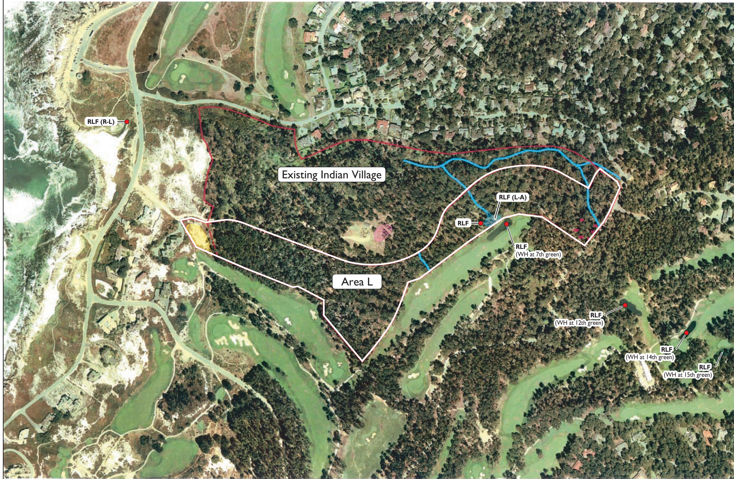
Figure E-21 Preservation Area L – Biological Resources