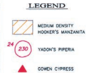
Figure E-24 Area F-I (Existing Lot) – Biological Resources