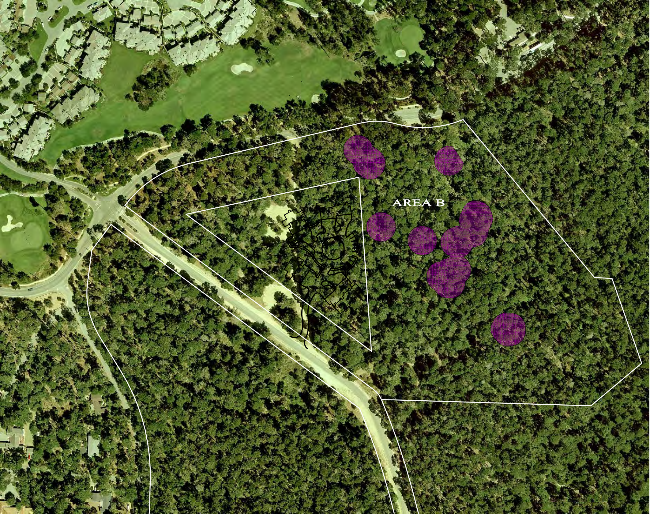
FIGURE E-12-YP Spanish Bay Employee Housing (Area B) Yadon's Piperia Occurrence and Disturbance areas