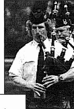
Pipers are a popular attraction at the festival.