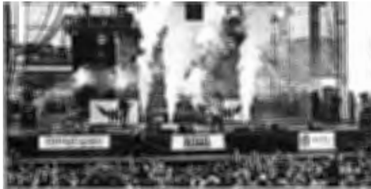
Performers on stage at Spirit West Coast.

It has been a busy month for the Parks Department, with two big events bringing lots of folks to two county parks.